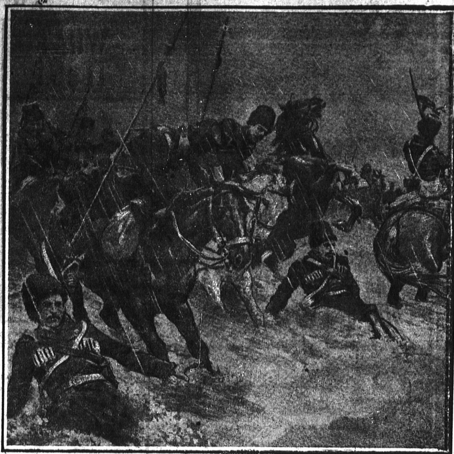
COSSACKS ENCOUNTERING DIFFICULTIES.