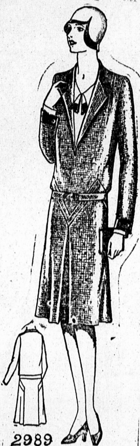
2989 A fascinating model in printed silk tweed expressing new vogue for semi-tailored sports line for general wear.

ished with applied bands, accentuates slimmness through the hips. The hemline is slightly flaring with inverted plait at center-front. Narrow belt marks normal waistline.