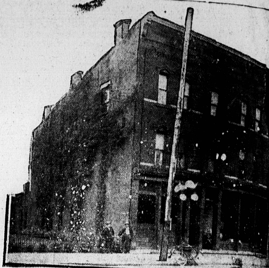
Home of the Marion Star, the paper over which President Harding has now relinquished control.