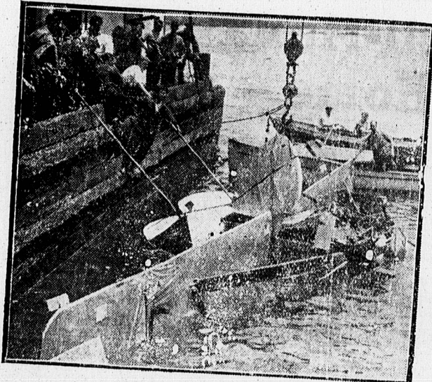
Grover Loening, plane inventor and builder, nudged into the East River while he and three others were experimenting with a new air yacht. The machine was completely wrecked.