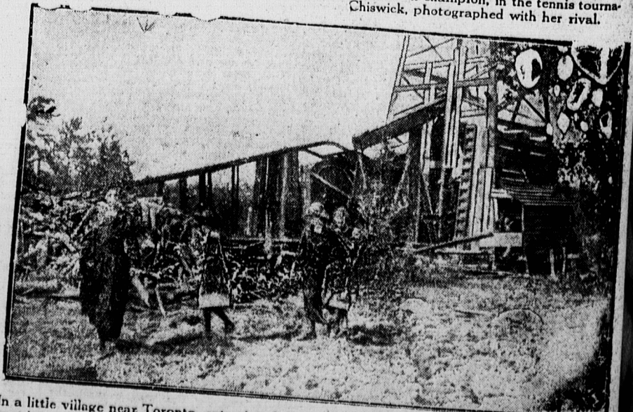
In a little village near Toronto, extensive drilling operations are being carried on for oil. The spot is a mecca for visitors from the surrounding districts but so far there have been no results.