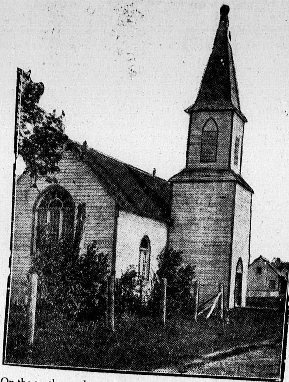
On the southern edge of the far north. The little white Anglian church at Moose Factory on James Bay, the only church in the settlement.