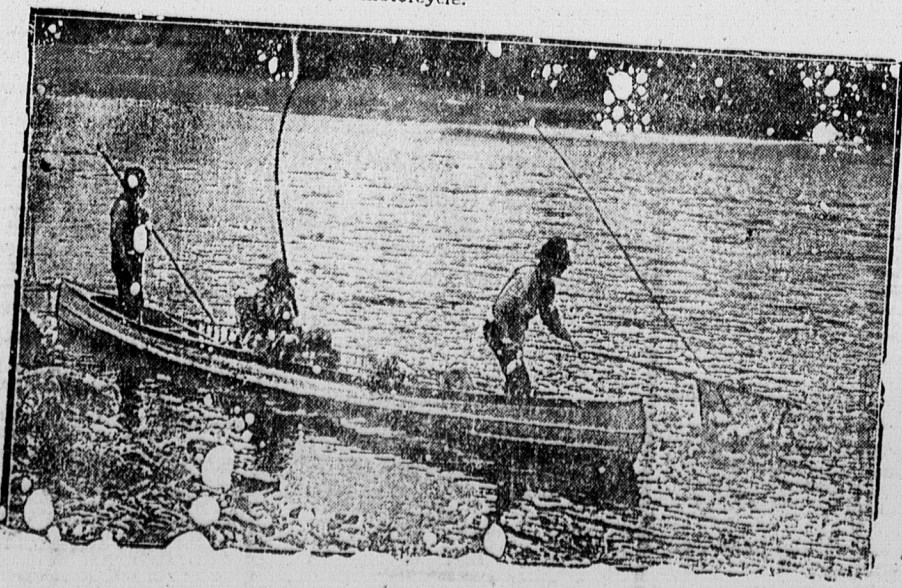
Landing a big one in a Nova Scotia lake.