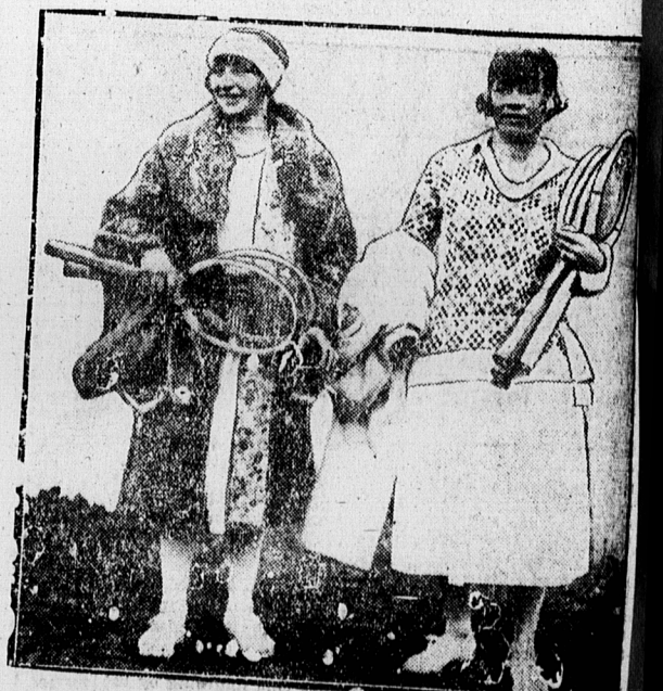
Miss McKane, the English girl who defeated Mrs. Mallory, the American champion, in the tennis tournament at Chiswick, photographed with her rival.