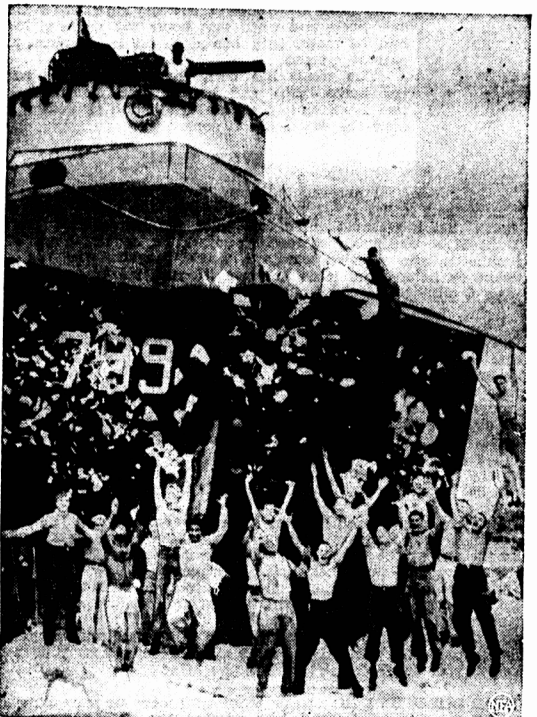
Japan surrendered unconditionally to the Allies, thus ending World War II. That was the news from the White House at 7 p.m. (EWT) on Aug. 14, 1945. The order went out to cease fire and there was rejoicing throughout America, on the battlefields abroad and wherever peace-loving peoples were to be found throughout the world. In Japan, newspapers and government officials spoke against the war, but a wave of hara-kiri already had begun with the Jap war minister.