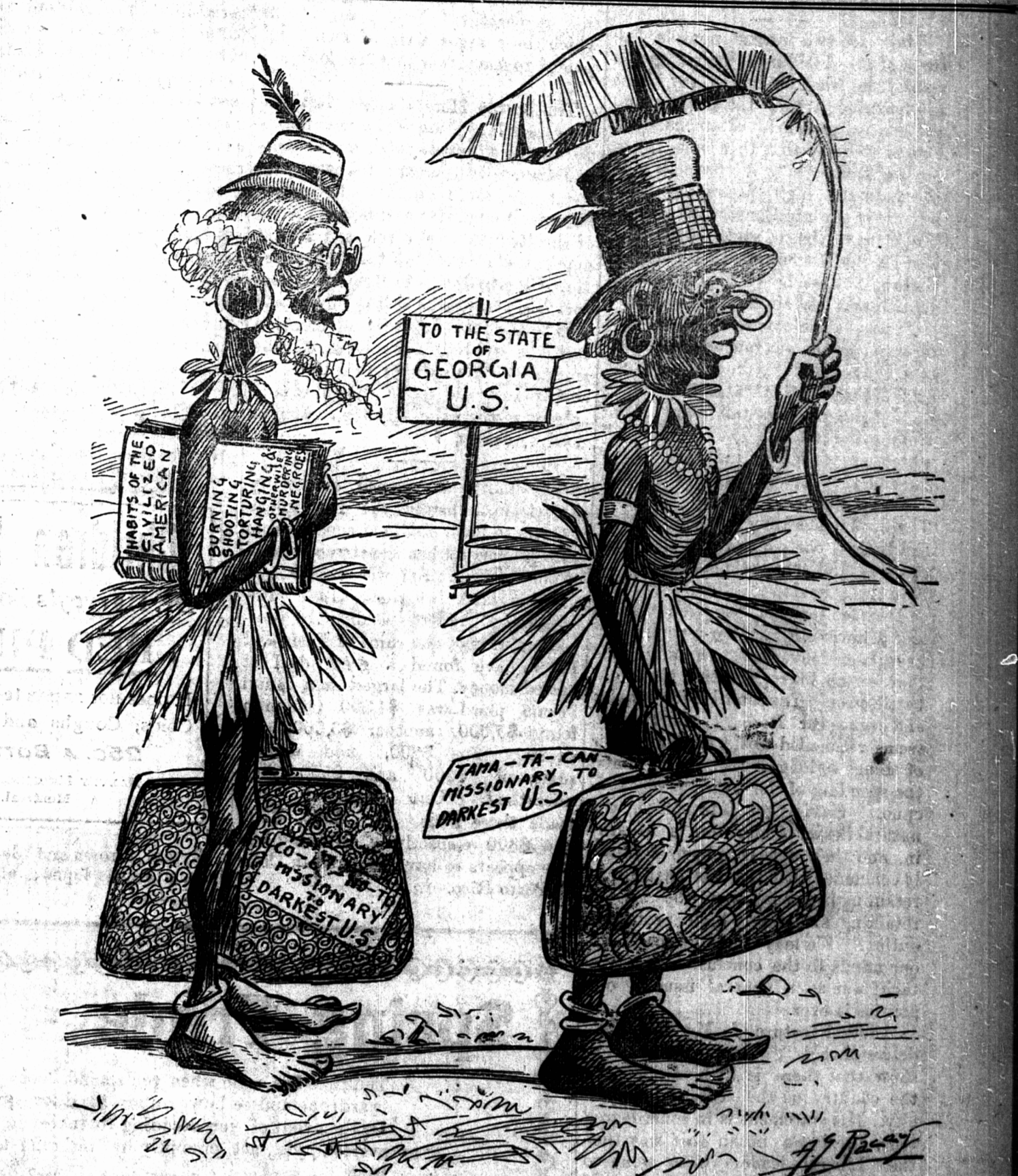
THIS NEXT IF THE UNITED STATES KEEPS ON BURNING, MURDERING AND TORTURING NEGROES.