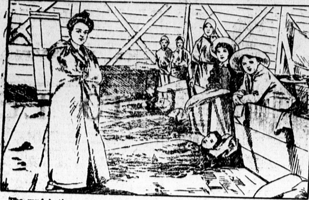
SCENE IN A RUSSIAN MUD BATH.

The mud baths at Saki, in the Crimea, have a wide reputation in Europe, and many wonderful cures of rheumatism, sciatica and even appendicitis are accredited to them. The mud used is obtained from the salt lakes in the vicinity. This is heated to a temperature a few degrees short of the boiling point by the sun, and patients are enveloped in it for twenty minutes and then put to bed to undergo free perspiration.