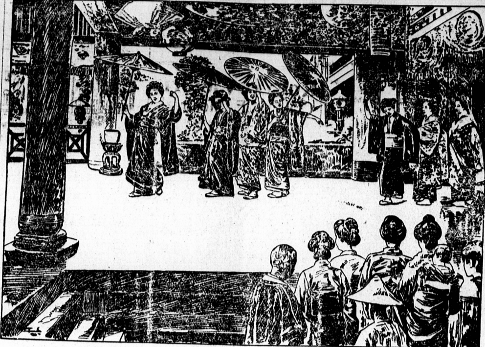
THE FAMOUS JAPANESE RHODODENDRON DANCE.

The picture illustrates a scene in a geisha house at Tokyo. In Japan each of the favorite flowers has a certain day set apart in its honor, and the places of popular amusement known as geisha houses arrange festivals to symbolize the flower which is being honored. The rhododendron dance is one of the prettiest of these flower celebrations and is very popular in Tokyo.