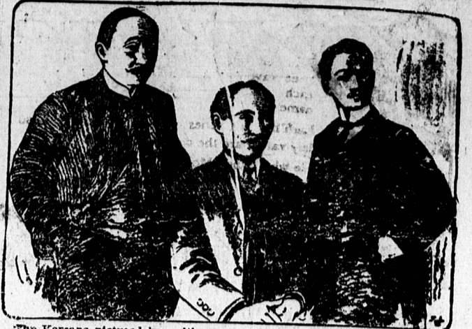
KOREAN MISSION TO THE HAGUE.

The Koreans pictured herewith were sent by the recently deposed emperor of that country to The Hague to protest against the further occupation of his country by the Japanese. As soon as the Japs knew of it they compelled the old ruler to abdicate in favor of his eldest son, who now reigns at Seoul under the protectorate of the mikado.