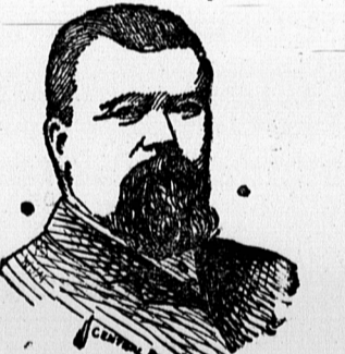
HON. THOMAS GREENWAY. Ex-Premier of Manitoba, who died Friday in Ottawa.