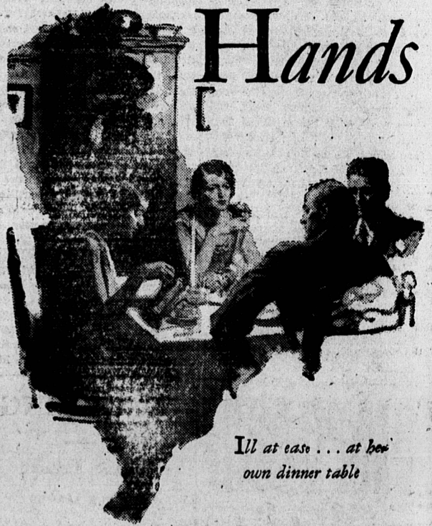
Ill at ease... at her own dinner table