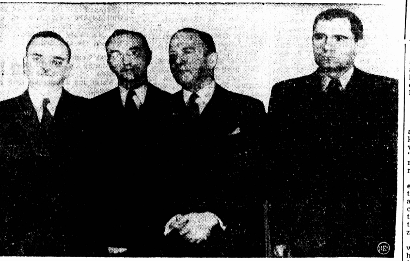
YANK IN THE KREMLIN —The new U. S. Ambassador to Russia, Alexander G. Kirk (second from right) poses with high Soviet officials after presenting his credentials at the Kremlin. From left to right are N. M. Shvernik, representative of the Supreme Soviet of the U.S.S.R.; an unidentified man; Kirk; and Andrei Gromyko, deputy foreign minister.