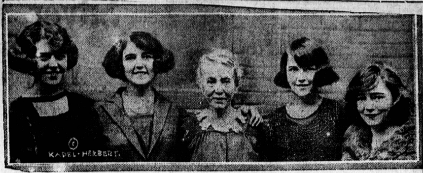
GIRLS WITH WOMAN THEY SOLD THEIR HAIR TO AID.

Take Your Order For Printing TO The Central Job Printery 176 KENT STREET CHARLOTTETOWN, TELEPHONE 480-L