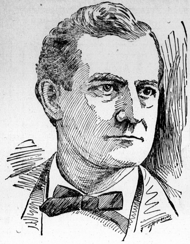
W. J. BRYAN. The choice of the democrats of the United States.