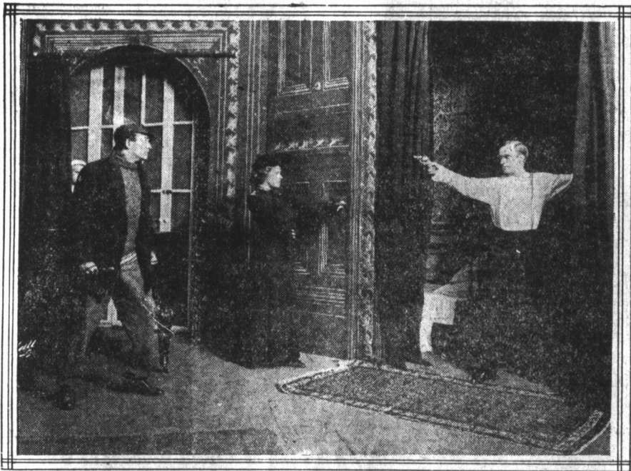
THE CAPTAIN SCENE IN IN THE BISHOP'S CARRIAGE

one corner of the dining-room is a magnificent old brown oak cabinet dated 1601. In another corner is Rossetti's armchair. But in his workshop, as he calls the cottage in which he writes, the furniture is of the plainest description. It is often said that Hall Caine is one of the few authors who have never known rejections but this is a very great mistake. Not