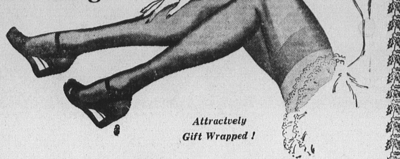
Attractively Gift Wrapped!