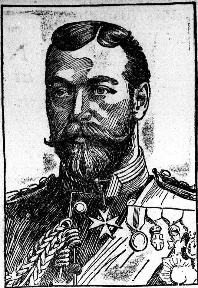
HIS MAJESTY GEORGE V.

Who will attend an International Exposition in Australia in 1914.