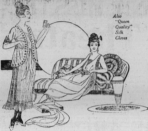
Also "Queen Quality" Silk Gloves