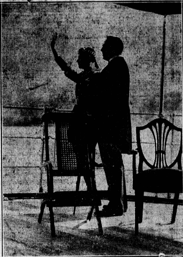
Prince and Premier from their deck on the Canadian Pacific S. S. Empress of Australia obtain their first view of Quebec.

GREAT GEORGE STREET CHARLOTTETOWN, P. E. I.