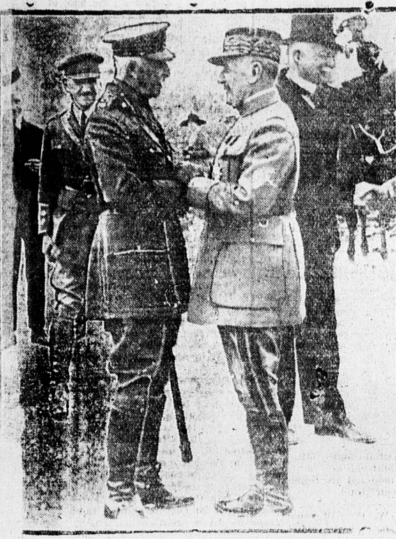
Photo shows the meeting of the Duke of Connaught and Messrs. at the unveiling of the monument to the Canadian troops who died at Ypres during the world war.