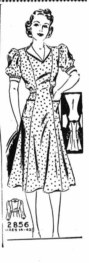
Style No. 2856

Design No. X 321 Name _____ Address _____