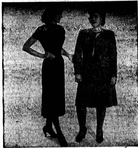
SEE WHAT A DIFFERENCE EXCESS FAT MAKES!

Unconditionally Guaranteed to help you lose ugly fat without drugs, laxatives, massage or exercise