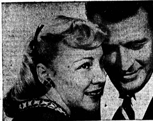
WHEN FAT COMES — THEN ROMANCE GOES!

Don't wait another day: Start losing weight at once, or you get all your money back: Ask your druggist for the Meltoway Dietary Reducing Plan, and check your weight before and while following the plan. If you are not completely satisfied with the results, return the empty bottle and your money will be refunded in full. Have no doubts as to whether this Meltoway Dietary Reducing Plan will work: It cannot fail to work, if you follow it faithfully. So make sure you buy the original Meltoway Dietary Reducing Plan, identically as sold in the United States. Accept No Substitutes.