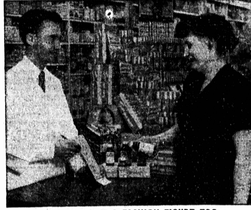
YOU CAN HAVE A FASHION FIGURE, TOO

Men want sweethearts or wives who keep their youth and loveliness: The Meltoway Dietary Reducing plan should be your permanent happiness Plan. Don't let your graceful, desirable figure get away from you, and he'll never let you get away from him!