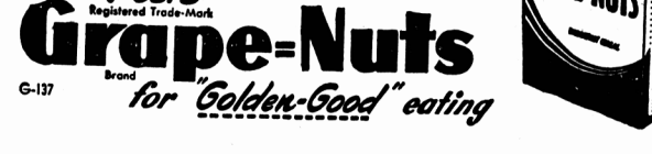
Post's Grape-Nuts for "Golden-Good" eating

And Grape-Nuts are so good for you. The fine food values of two grains—not just one. And the digestibility that comes from double-baking. Have you had Grape-Nuts lately? Get some from your grocer. Remember, there are 14 to 16 servings in the new red-white-and-blue Grape-Nuts package. Compare that with other cereals.