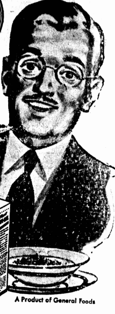
A Product of General Foods