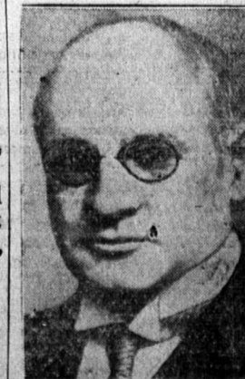
TO LEAD NEW PARTY Hon. H. H. Stevens, former minister of trade and commerce and originator of the price spreads investigation, announced formation of a new party, composed of those "who believe both the old parties are equally hopeless."

(C. F. By Guardian's Special Wire) WOLFVILLE, N. S., July 12—Early this morning doctors predicted the young girl could not live through the day. Both her legs and an arm were fractured and she was suffering other severe injuries.