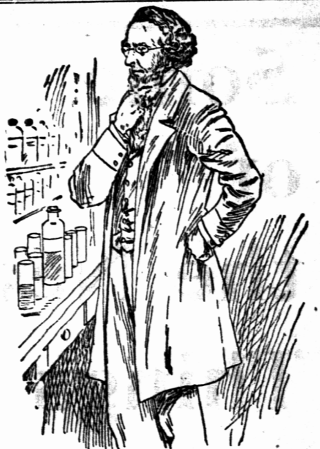
DR. A. W. CHASE AT WORK ON HIS LATEST GREAT REMEDY.