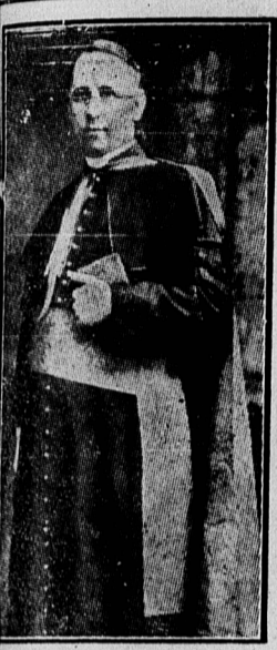
HIS EXCELLENCY BISHOP O'SULLIVAN

Who attended the opening of the Diocesan Assembly of the Eucharistic Congress at Miscouche last evening.