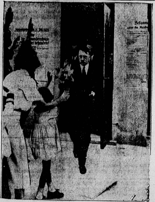
Adolf Hitler leader of the powerful Nazi party in Germany, photographed July 31 as he emerged from Hitler after voting in the recent elections in Munich. Berlin reports said Hitler loomed more prominently than ever as President von Hindenburg's choice for chancellor of Germany.