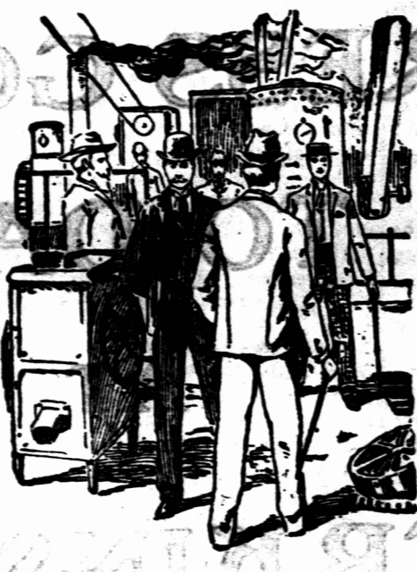
SEITNER TRAINOR & CO.

To prove to you that Dr. Chase's Ointment is a certain and absolute cure for each and every form of itching, bleeding and protruding piles, simulate in the daily press and ask your neighbors what they think of it. You can use it and get your money back if not cured. One box, all dealers or DR. CHASE'S OINTMENT , Toronto.