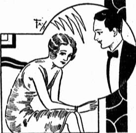
HOW LONG WOULD THE CASH LAST He (passionately): My love will last forever! She (unemotionally): How about your cash?