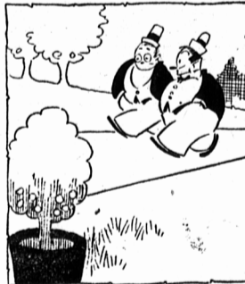
FIRST HOT SPRING DAY "I don't believe old Titewad has ever done anything freely in his life." "I suppose not, but when I met him this morning he was perspiring that way."