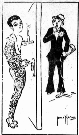
"What a man keeps under his hat is usually nothing to brag about."