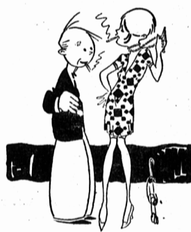
He: Why do you call me "mustard" when we're dancing? She: You're always on my dogs.