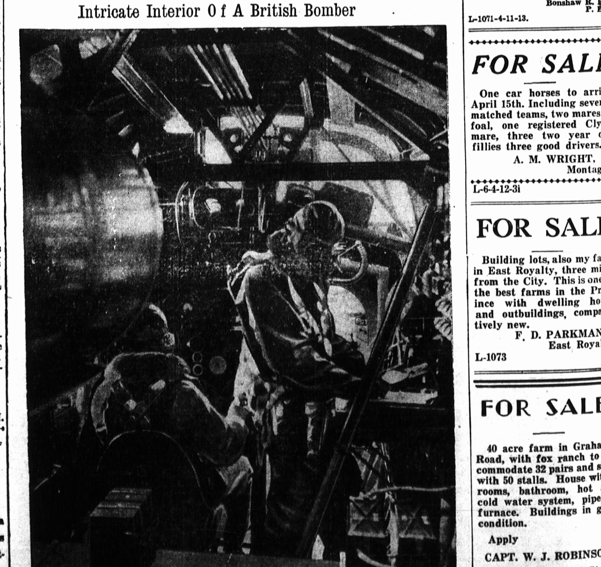
Here is an interesting glimpse into the quarters of one of the largest machines of the Royal Air Force. At first glance it suggests the intricate mechanism of a submarine. The radio operator is seen seated on the left with his receiving and transmitting controls placed directly before him, while on the right is the reserve pilot busily engaged at his navigation and chart table checking up the exact position of the plane. Space for movement is restricted by the mass of specialized control mechanism.

40 acre farm in Graham's Road, with fox ranch to accommodate 32 pairs and shed with 50 stalls. House with 6 rooms, bathroom, hot and cold water system, pipeless furnace. Buildings in good condition. Apply CAPT. W. J. ROBINSON, 146 Pownal Street, Charlottetown L-1092-4-11-61