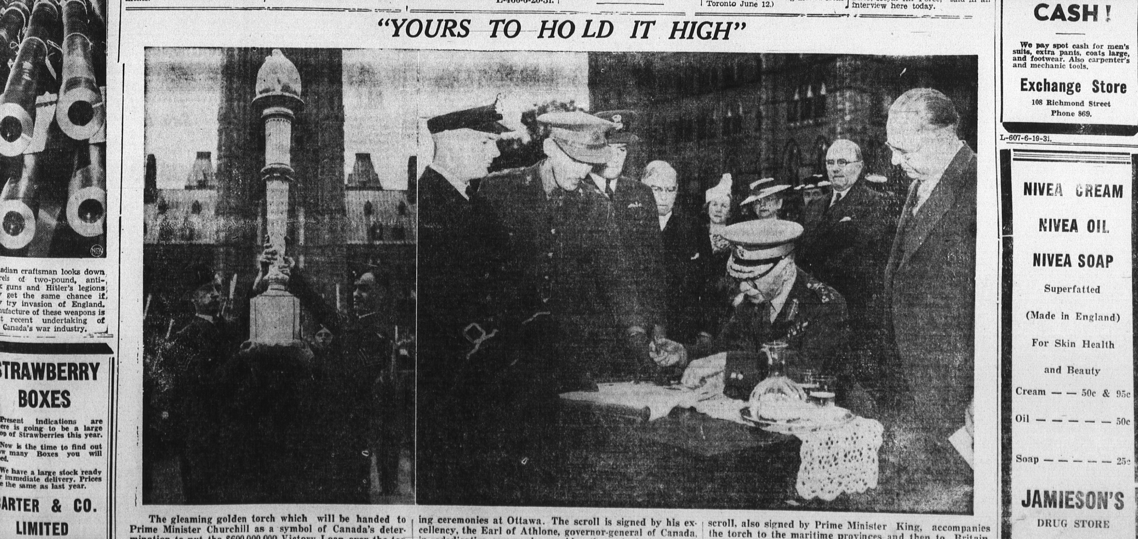
The gleaming golden torch which will be handed to Prime Minister Churchill as a symbol of Canada's determination to put the $600,000,000 Victory Loan over the top is shown, LEFT, in the hands of its airmen guardians during ceremonies at Ottawa. The scroll is signed by his excellency, the Earl of Athlone, governor-general of Canada, in rededication ceremonies marking the arrival of the torch in Ottawa after its flight across Canada, RIGHT. The scroll, also signed by Prime Minister King, accompanies the torch to the maritime provinces and then to Britain. Before that time, the loan, now over the $400,000,000 mark, must be completely subscribed.