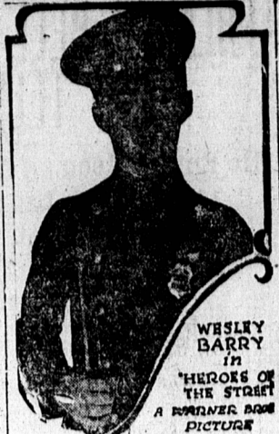
WESLEY BARRY in 'HEROES OF THE STREET' A WARNER BROS. PICTURE