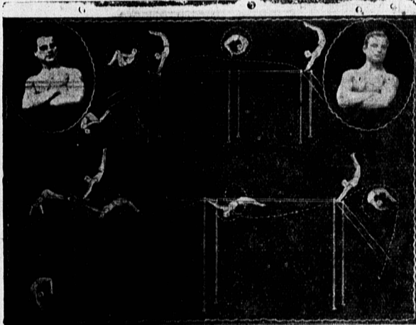
THE LARGARDS The Triple Horizontal Bar Acrobats

ALL THE BEST LIVE STOCK IN THE MARITIMES--ALL THE BEST RACE HORSES