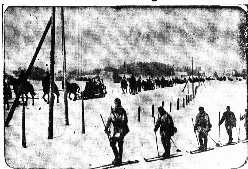
Here you see artillery on sleighs and troops on skis! It is not long ago that the jungle of sleigh bells meant that Santa Claus was on his way. Now, in Finland, it means that death is on his way for Red troops who are engaged in the bestial assault on that little country. The "ski cavalry" has penetrated Russian territory in several spots and is reported to have cut the railway line to Murmansk over which supplies for that Arctic port and the troops attacking Finland are carried.