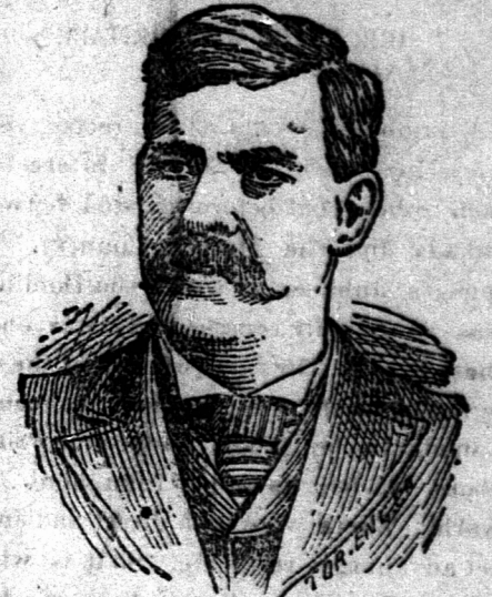
HON. NATHANIEL CLARKE WALLACE, M.P.