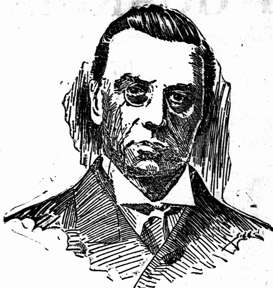
HON. JOSEPH CHAMBERLAIN.

Milburn's Heart and Nerve Pills are 50 cts. box, or 3 for $1.25, all dealers or THE T. MILBURN CO., Ltd, Toronto, Ont.