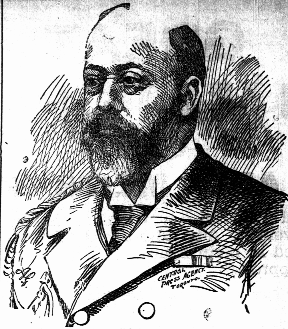
KING EDWARD VII.

(Cairns & McLean's Old Stand, Kent St., Charlottetown. Tues, fri & w