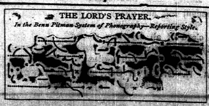
THE LORD'S PRAYER. In the Ben Pitman System of Phonography—Reporting Style.