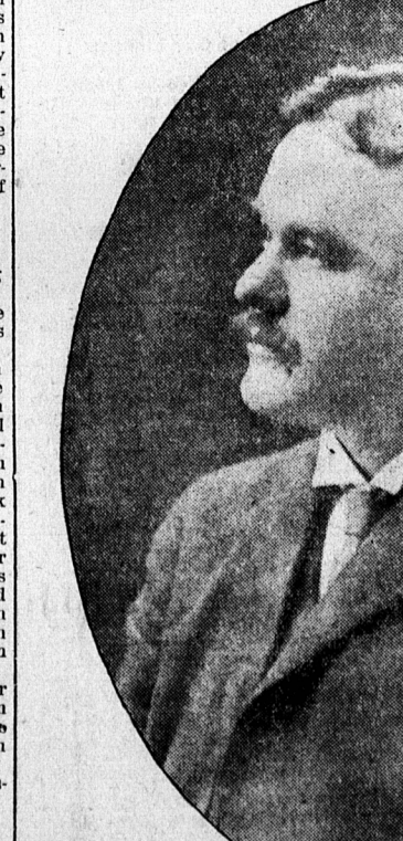
HIS HONOUR PREMIER MATHIESON.