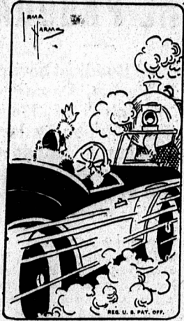
"Whether the car beats the train or not the motorist usually gets a cross."