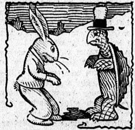
Turtle: What makes March hare mad? Hare: Answering fool questions!

THE BALL PLAYER They baked his arm, So it is said, But had they only Baked his head They had, it is Quite safe to say, Come nearer where His weakness lay.