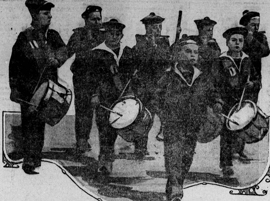
MERE BABES GO TO WAR IN FRANCE. French drummer boys marching off to join their fighting brothers and fathers.