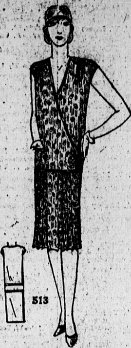
CHIC SIDE FLARE

Distinctive, simple and smart. It's slender too, for the surplus bodice adds considerable length to figure. It features the cascading flare, a new means of adding fullness to hem of straight slim silhouette. It's enchantingly lovely in flowered georgette crepe in yellow and soft brown tones as sketched in 'Style No. 524. It's a combination that can be worn for street or afternoon, and is smart worn with straightline coat in beige or brown to complete ensemble. It can be made without sleeves by finishing armholes with self-fabric binding. Crepe Elizabeth, chiffon, printed handkerchief linen, silk crepe, dimity and rayon chiffon voile other appropriate fabrics. Pattern for this Parisian model comes in sizes 16, 18, 20 years, 26, 28, 30 and 32 inches bust. Price 15 cents in stamps or coin (coin is preferred). Wrap coin carefully.