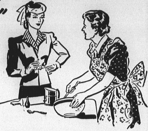
"Three eggs in a cake?" I said. "Not while my sister in England gets one egg a week!"