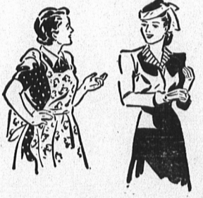
"When my girl wanted a new outfit, I said to her, 'If you were in the Navy, I suppose you'd say to the Captain, please can I have another ship? This one's out of style!'"