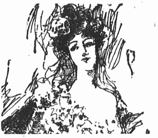
The American Girl.