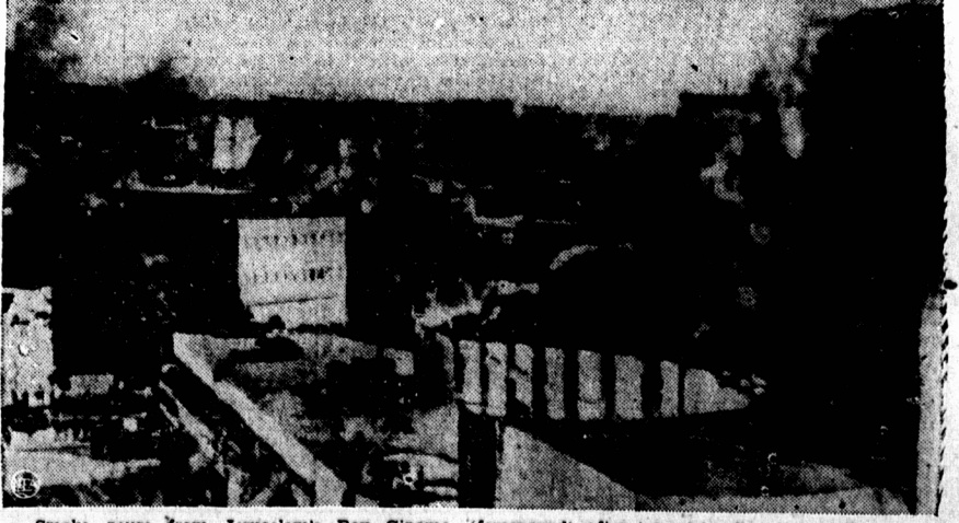
Smoke pours from Jerusalem's Rex Cinema (foreground) after terrorists allegedly set fire to the theater in retaliation for Arab violence which followed the United Nations' decision to partition Palestine. Three-quarters of the ownership of the theater is held by Arab interests, one-quarter by Jews. Other terrorist fires can be seen in the background.