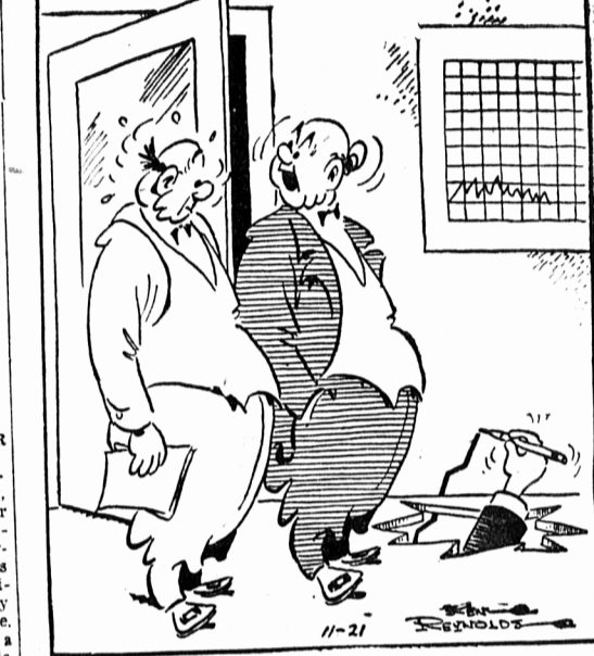
"Why don't we ever use a Guardian Want Ad — they do downstairs?"