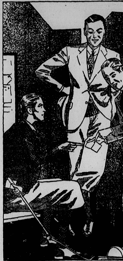
BOYS TWEED SUITS

in long pants, sizes 26 to 36. Special price ..... $9.90