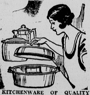
KITCHENWARE OF QUALITY

Look for the Perfection Sign on the Perfection Shop