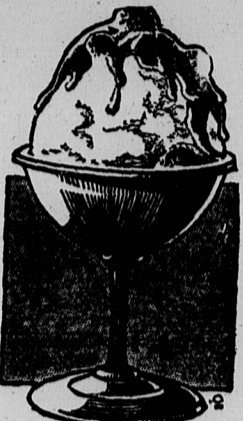
"A Dream of Fruit and Cream"

Perfection quality is the same all over the Province. It is sent out in good condition and our dealers make it a point to keep it that way.