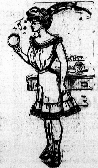
CORSET COVERS 306--28c DRAWERS 608--29c

Nothing wrong with a single garment that one visit to the laundry will not rectify. Today they are yours at HALF PRICE