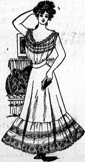
CORSET COVER 345--58c SKIRT 785--$1.50