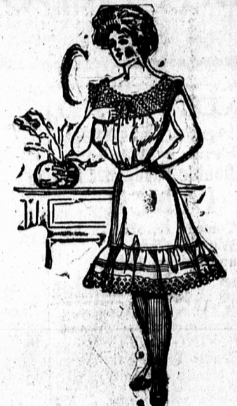
CORSET COVER 309--52c DRAWERS 608--38c