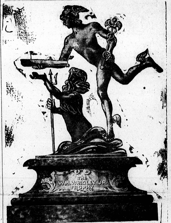
$22,000 PRIZE FOR WORLD'S FASTEST MOTOR BOAT