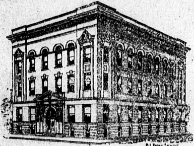
Y. M. C. A. BUILDING MARION, IND.

The cut at the head shows the exterior of the Y. M. C. A. building at Marion Indiana. This building cost with the lot and furnishings about fifty thousand dollars. This is the type of building which Charlottetown should have. The need of more room for the local Association is realized by all who are in close touch with the work which this institution is doing. Some people think that Charlottetown could not support such a building if it was secured. This idea seems to be a natural one to any person who is not in touch with what is being accomplished by the Association where it has a modern building. It is pointed out that it is difficult to finance the work in the present building. This is true and the older the building becomes, and the less it is