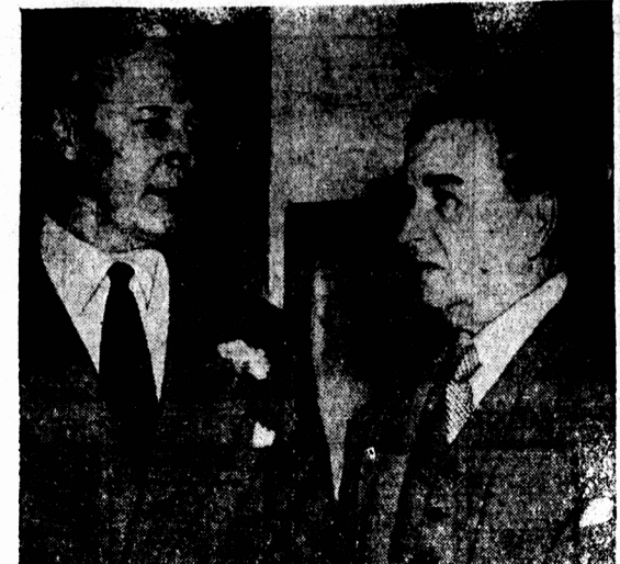
Support in Quebec for federal Progressive Conservative leader George Drew has come from Premier Maurice Duplessis whose Union Nationale party commands an overwhelming majority in the provincial legislature. Federal P.C. candidates are receiving the support of the Duplessis administration. Drew, left, and Duplessis, right, have one aim in common—defeat of the Liberals.