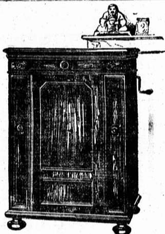
ORFEDENZA MODEL PRICE $385.00

Before pouring liquid into a glass place a small glass inside of a larger one. This will keep the outside glass cool.