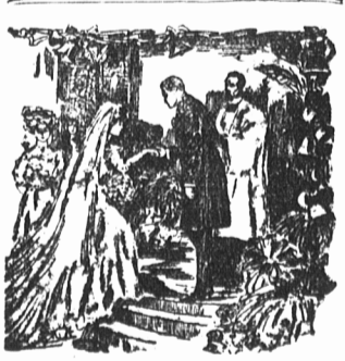
THE MARRIAGE QUESTION.

ONLY EXECUTED INTENTIONS COUNT The paving of the road to a very uncomfortable place is said to be composed of good intentions. Nowhere else has this material been tried for paving, though it is plentiful enough to use for almost any purpose. We all know people whose houses burn when they are "just going to" insure; who lose a cow or a horse when they are "just going to" mend the fence or close the gate; who are "just