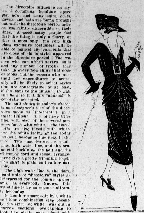
Here's One Designer's Interpretation watching, but so far the straight line frock and the generous range of saffron offered early in the season are suffering more severely so far as sales are concerned.