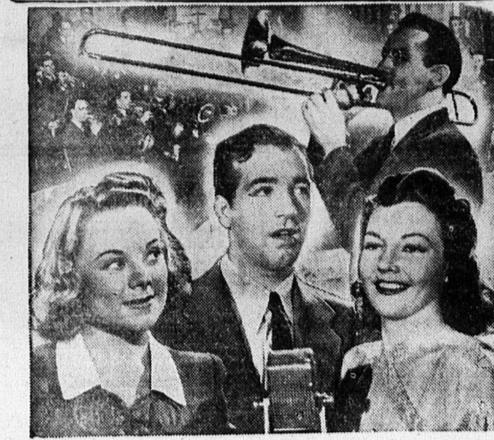
Breath-taking new skate and ski surprises are provided by Sonja Henie in her latest picture, "Sun Valley Sereade" in which she is starred with John Payne, Glenn Miller and his orchestra are featured, as are Milton Berle and Lynn Bari. Sun Valley Sereade plays at the Prince Edward Theatre to-day, Friday and Saturday.