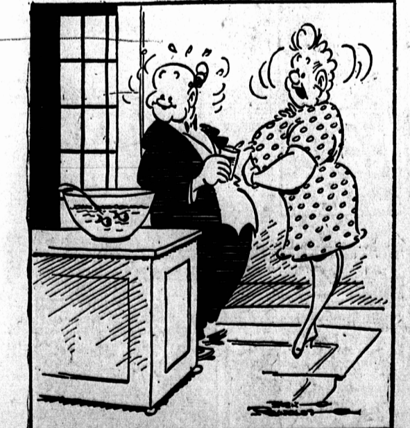
"Stop looking in the Guardian Want Ads for a pet dog—I don't want nothing to do with anything that's got anything to do with a Doghouse!"